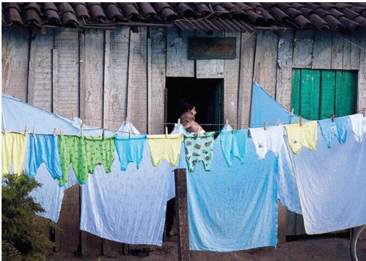
Piquiá de Baixo Community. Açailândia. Maranhão. Brasil.

of life that the company's activities bring about, increase and exacerbate the levels of violence against vulnerable groups, especially against women. 23