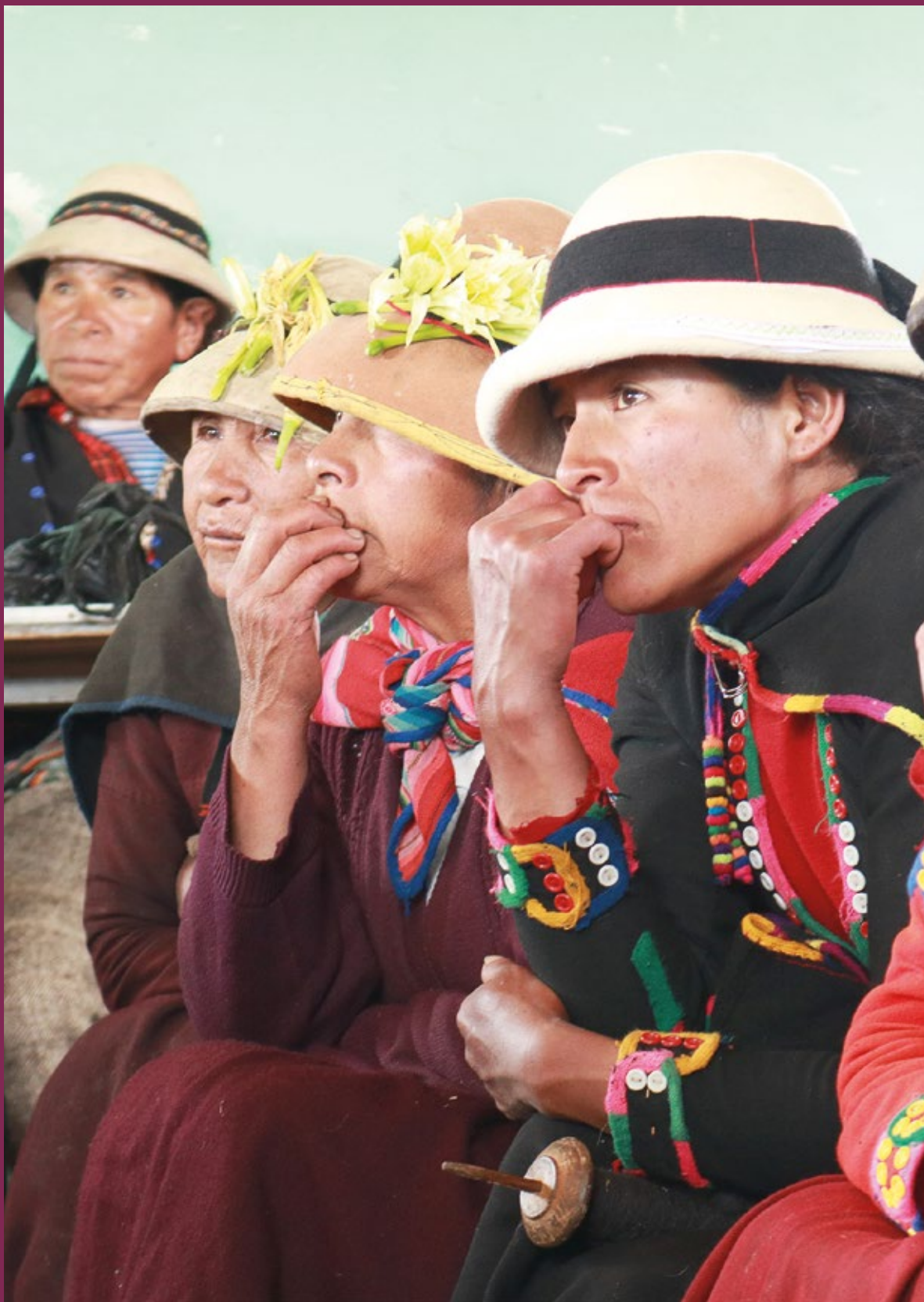
Andean South. Perú.