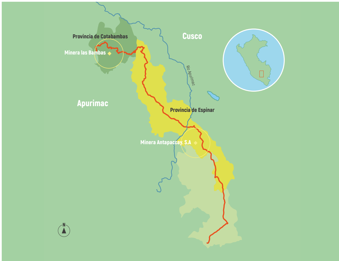
Figure 4. Copper mining in the Andean South