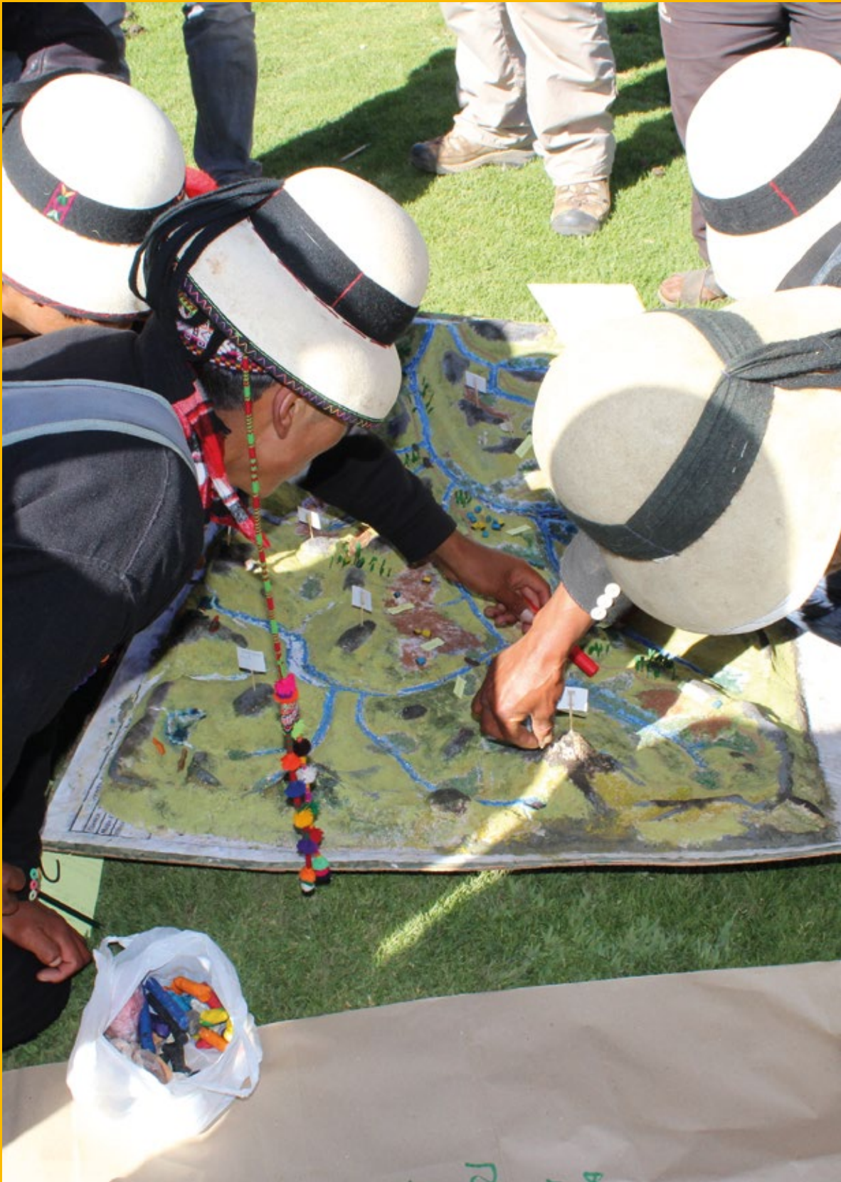
South Andean. Perú.