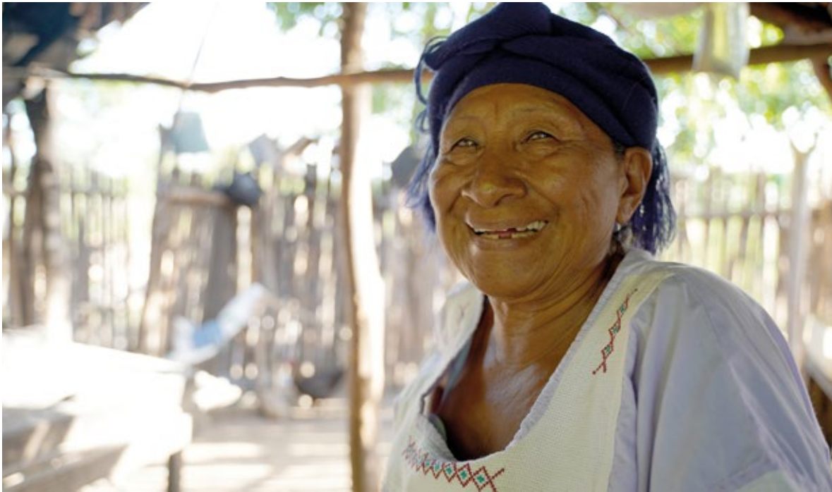
Wayú. La Guajira, Colombia.