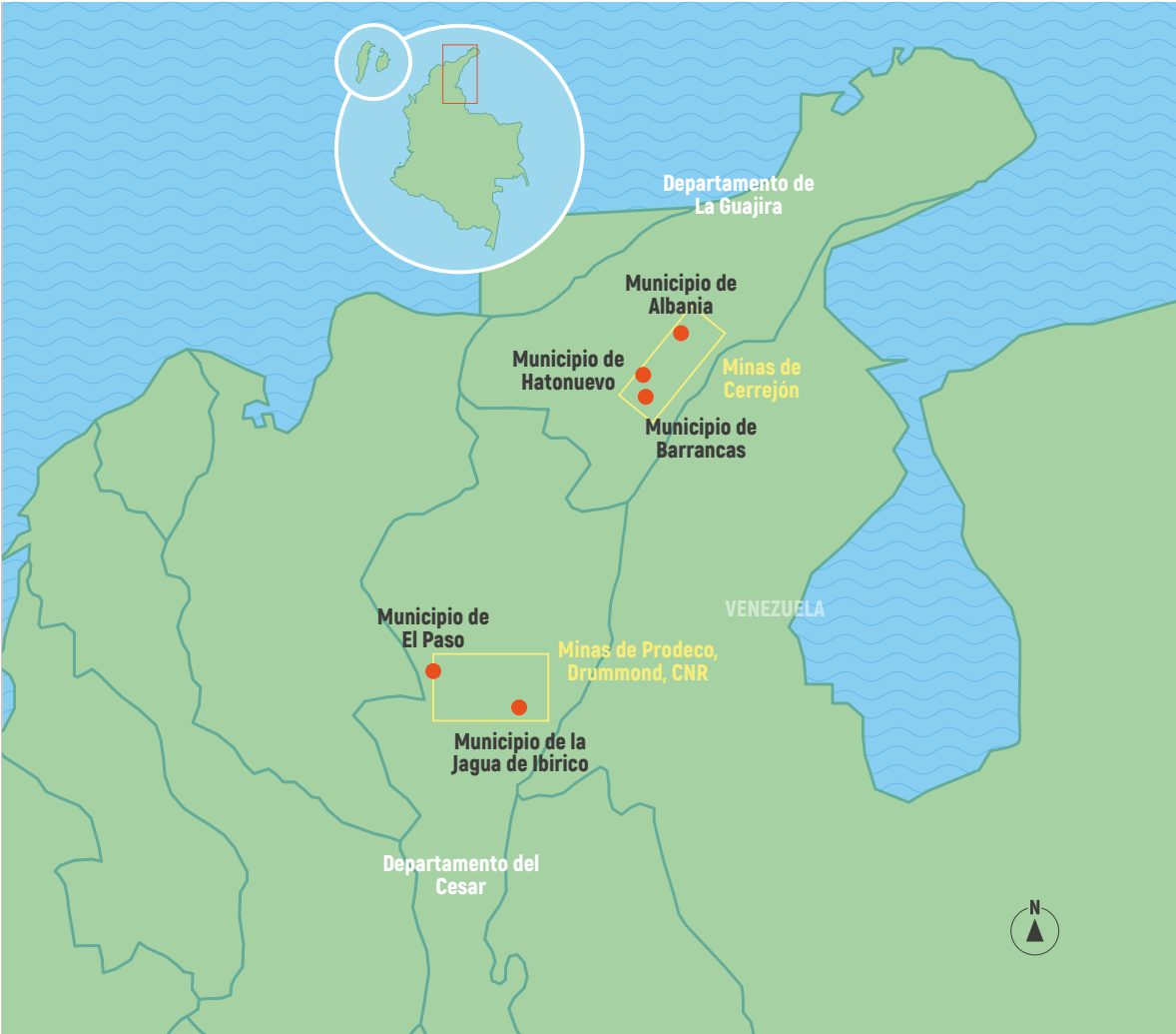
Figure 3. Mining corridor La Guajira - Cesar