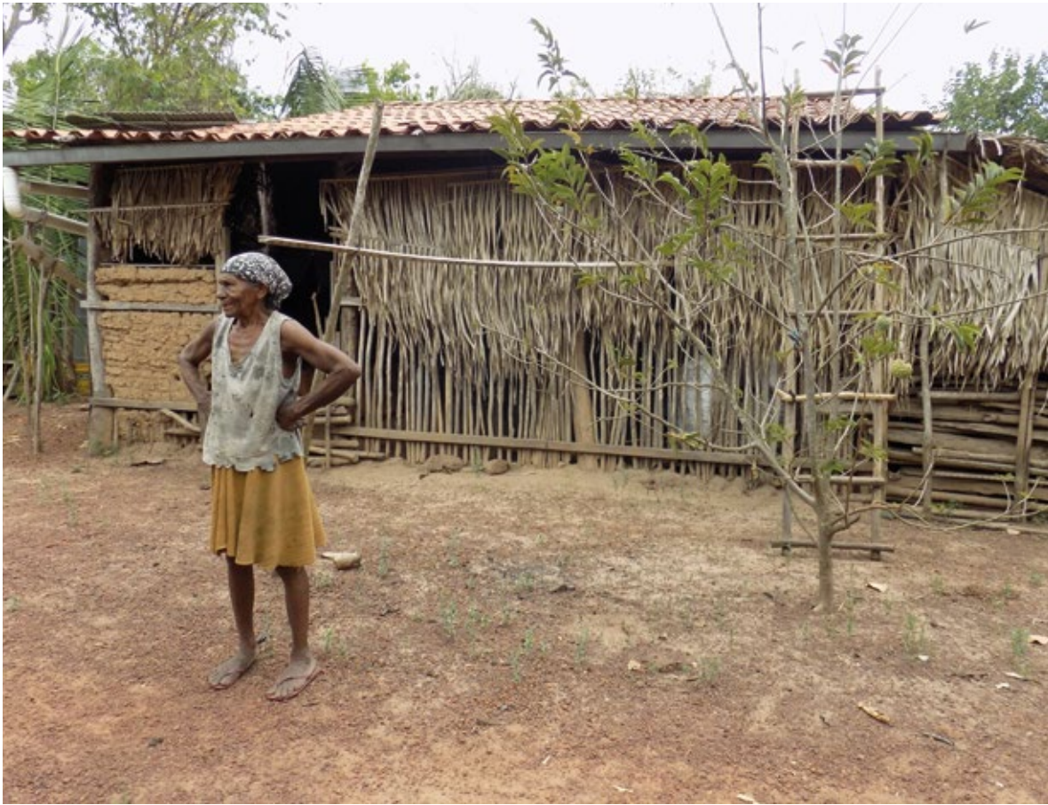
Mutum II Community. Arari Maranhão. Brasil.

were able to identify that, effectively, the five forms of criminalization are applied and that, furthermore, in the cases of Brazil, Perú and Colombia, it can be seen how law enforcement agencies (police and army) are deployed to protect businesses 8 and repress local communities when they protest. The strong militarization of extractive zones has not meant greater security for the affected populations.