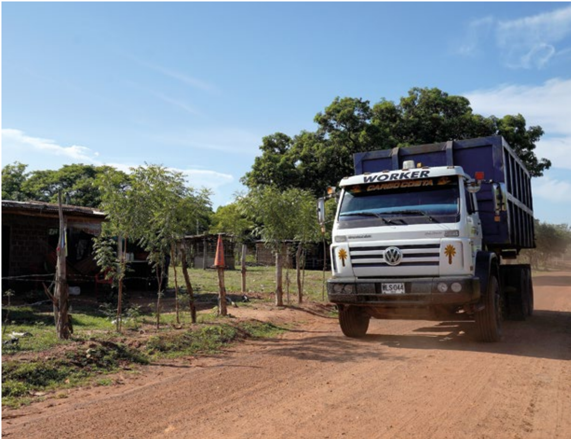
Vereda de El Hatillo, El Paso, Cesar, Colombia.

“ That businesses deny that their operations have negative effects related to human rights, hide diagnostics and information (even from State institutions), and discredit the claims raised by the affected communities”