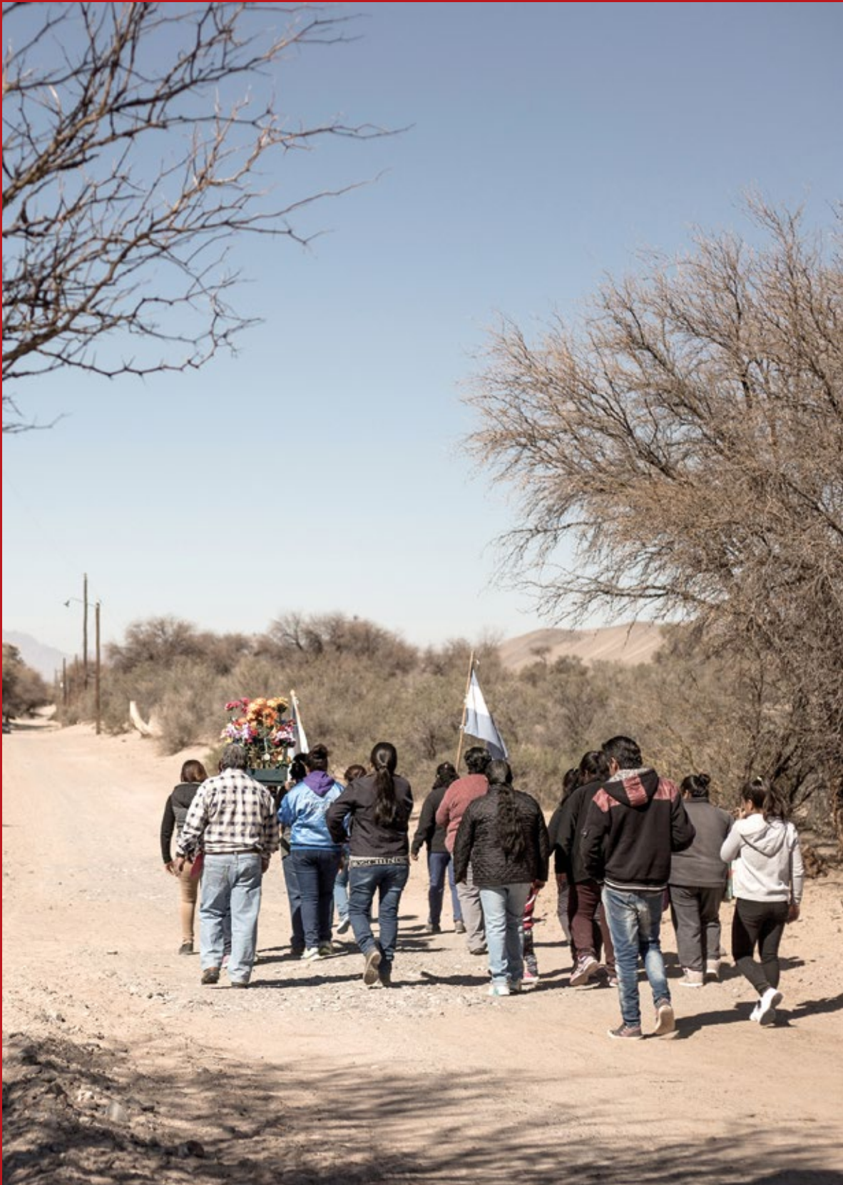
Los Nacimientos Fiambalá. Argentina. 2019.