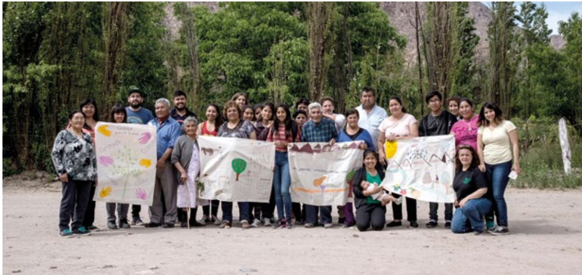
Fiambala 2019. Argentina.

“ The country has seen an acceleration in the search for lithium deposits and in licensing areas for production of this mineral, with the goal of becoming one of the world’s main lithium suppliers”