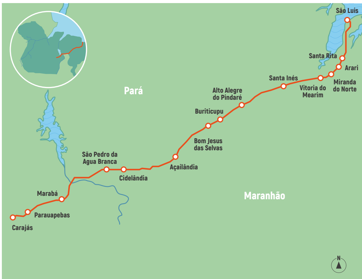
Figure 2. Mining and railroad in Carajás