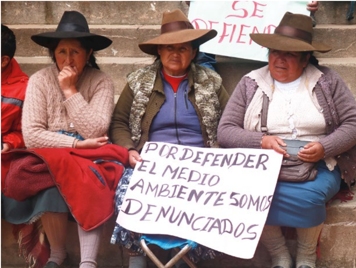
Defending the environment. Perú.

Company Glencore, for example, has a priority in its policies and worldwide statements to reduce its impact on water and is expressly committed to “understand our effect on the environment, minimise our water-related impacts and ensure that our activities do not compromise any shared use of water.” 38 Also, in its sustainability reports (2016–2018), the Chinese Company MMG points out that “we have the commitment to carry out our activities according to the Universal Declaration of Human Rights, the Guiding Principles on Business and Human Rights, and the Principles of the United Nations Global Compact.” 39 Despite the fact the businesses assume political commitments to respect human rights, as stated in their corporate and business marketing documents, neither Glencore nor MMG have been able to fulfill their responsibility to respect them in the places where they operate. In the context of their large-scale mineral extraction, transformation, and transportation activities, the companies Glencore and MMG Las Bambas affect the area where they operate, creating negative impacts on water and the environment, transforming the territories, and the relations between the communities that inhabit them. Due to their magnitude, these transformations can compromise the ways of living, customs, and even the very existence of the rural Indigenous communities of Cusco and Apurímac.