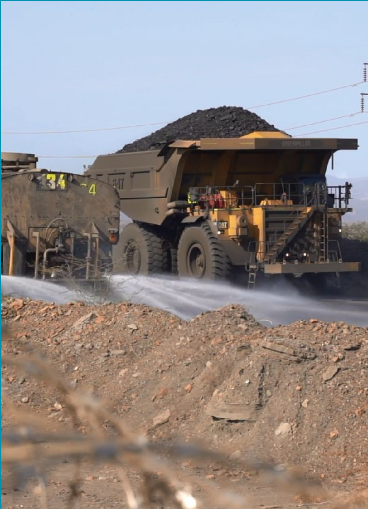
La Guajira, Colombia. Wastefulness. While La Guajira is suffering from water shortages, the mining companies are watering it on the roads. 2020. Photo: Santiago Londoño (PAS).