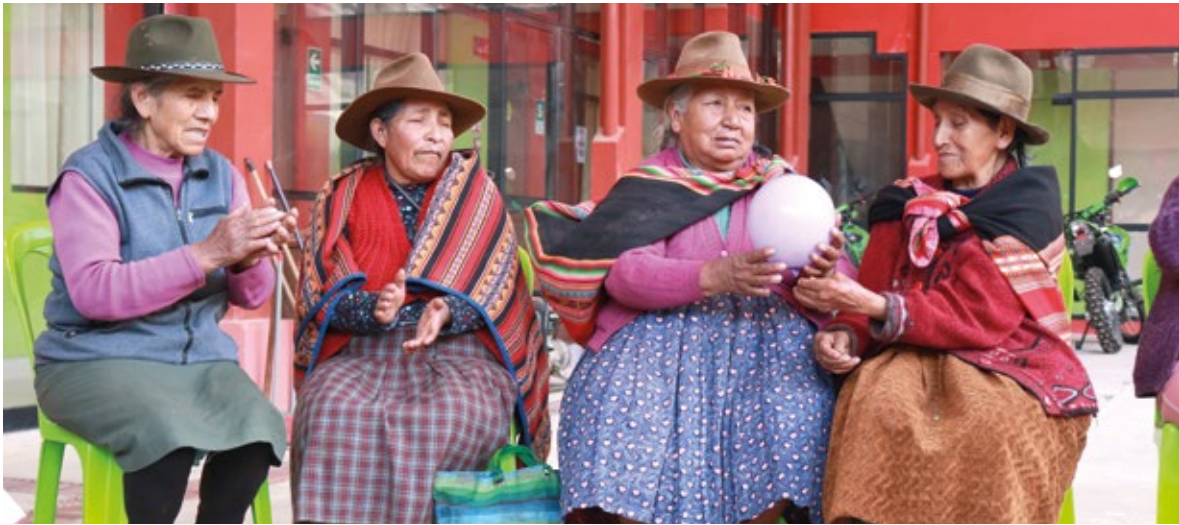
South Andean, Perú.

life occur in the context of a network of actors and practices in which businesses participate sometimes directly and sometimes indirectly or through complicity.