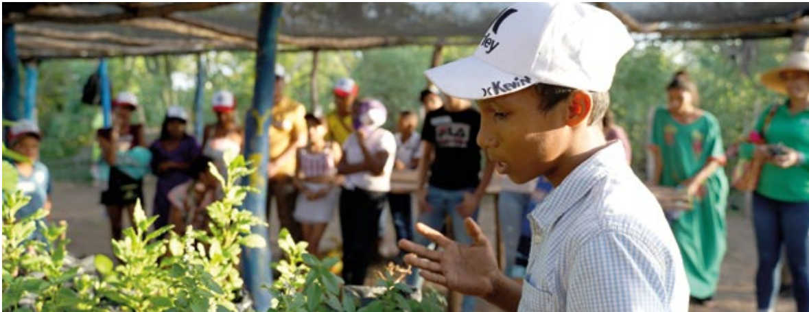
Young people in Tamaquito II working for the recovery of their medicinal plants. La Guajira. Colombia.

The territory is largely inhabited socially and culturally by indigenous, peasant and Afro-Colombian communities with deep-rooted practices of use of and care for the territory, managing their natural environment and maintaining self-sustaining systems of production by means of communitarian activities like fishing, hunting, agriculture, and a subsistence economy. Their vision of the world and the way of life of these communities have been affected in the clash with the vision and interests of the model of globalization and accumulation expressed in the extraction of coal by transnational corporations. Thus, this corridor has become a disputed territory with the imposition of strategies of dispossession, expropriation, appropriation of natural resources, and violence.