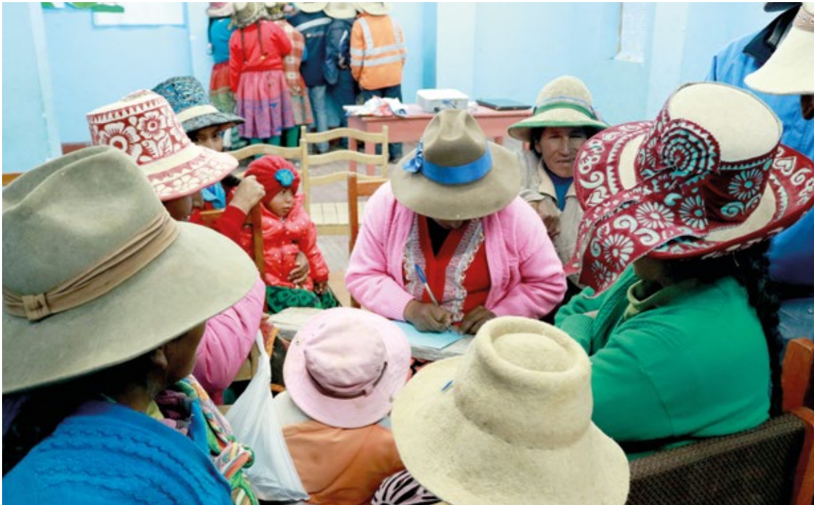
Andean South. Perú.

The relationship between businesses and human rights has not been addressed by the current legal and institutional framework in Perú. By the end of 2018, there was no policy, rule or regulation implementing this issue directly in the country, despite the adoption by the United Nations of the GPs in 2011 and the inclusion of these standards to the OECD in the same year. 40 On the contrary, after reviewing and analyzing different policy documents, it is seen that they use a language reluctant to make connections between businesses and human rights, with the exception of labor rights.