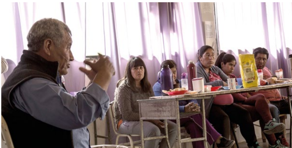
Medanitos 2019. Argentina.

without the participation of the communities or their representatives. This reveals the extent to which in the business sector the CSR approach still predominates and that the interpretation of the Guiding Principles is done within this framework and not from the perspective of human rights.